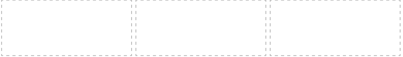
Dark Navy #22