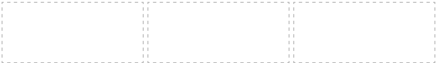
Orange HI-VIS EN 20471