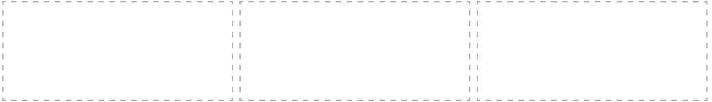
Optical White #01

65% POLYESTER 33% COTTON 2% ANTISTATIC 240 GSM, TWILL 2/1